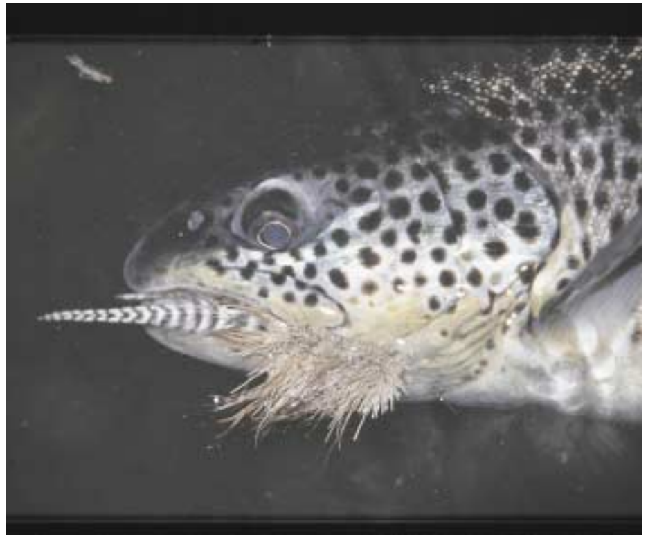
Above: Mouse imitations were very effective especially for the big browns. Biggest brown caught on a mouse was over 5 kilo. The takes were always explosive...

It is easy to predict that this year's Trout program, which will operate from this week onwards from the Varzina Lodge (the main camp), will have similar or even better success than what we had, in weeks