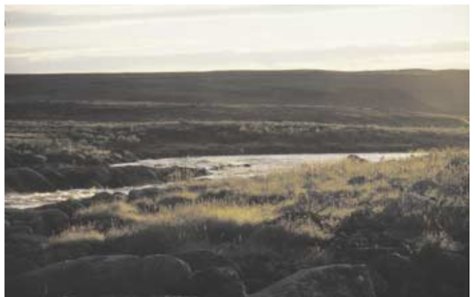
Above: Russian arctic tundra in the early morning light. Definitely the right moment to be there with a fly rod.

imitations. They are at the peak of their fitness and the runs and jumps can be unbelievable. Fish close to 1 meter length are seen on a regular basis, but landing one of those brutes is a tough job for anybody. Those guys have no rules and they know all the tricks there are. But the hooking of one those larger-than-life-sized browns is definitely an experience of a lifetime. Trying