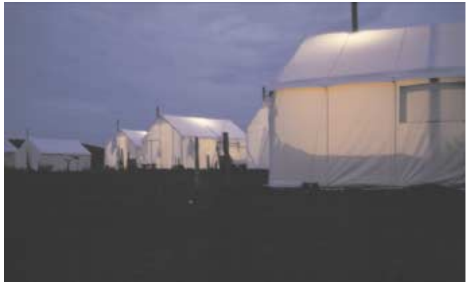
Above: Guest are accommodated in comfortable USA made heated tents with wooden floors, cots, and electric lights.

The camp itself had been upgraded for the season with new tent canvases and a fine Finnish sauna with showers. The sauna was very much welcomed and many anglers tried a Finnish sauna for the very first time. (Some of them spent actually almost as much time in sauna as they did on the river). The quality of the food was very good thanks to our new chef, who was borrowed for the summer from a Russian atomic ice-breaker. The portions were plenty and tasteful and the energy they provided was definitely