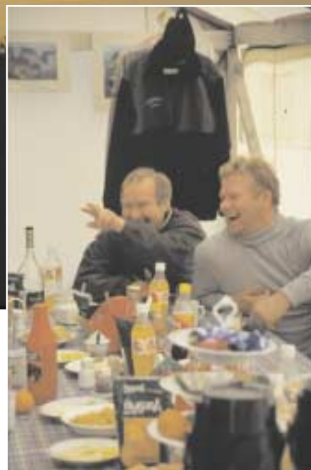
Above: Varzina Trout camp is a place where you can enjoy world class fly fishing in a friendly and safe atmosphere.

are used to secure this outstanding brown trout fishing for the future fishermen. Catch&Release with barbless hooks is the natural way of fishing this beautiful and remote river in Russian tundra.