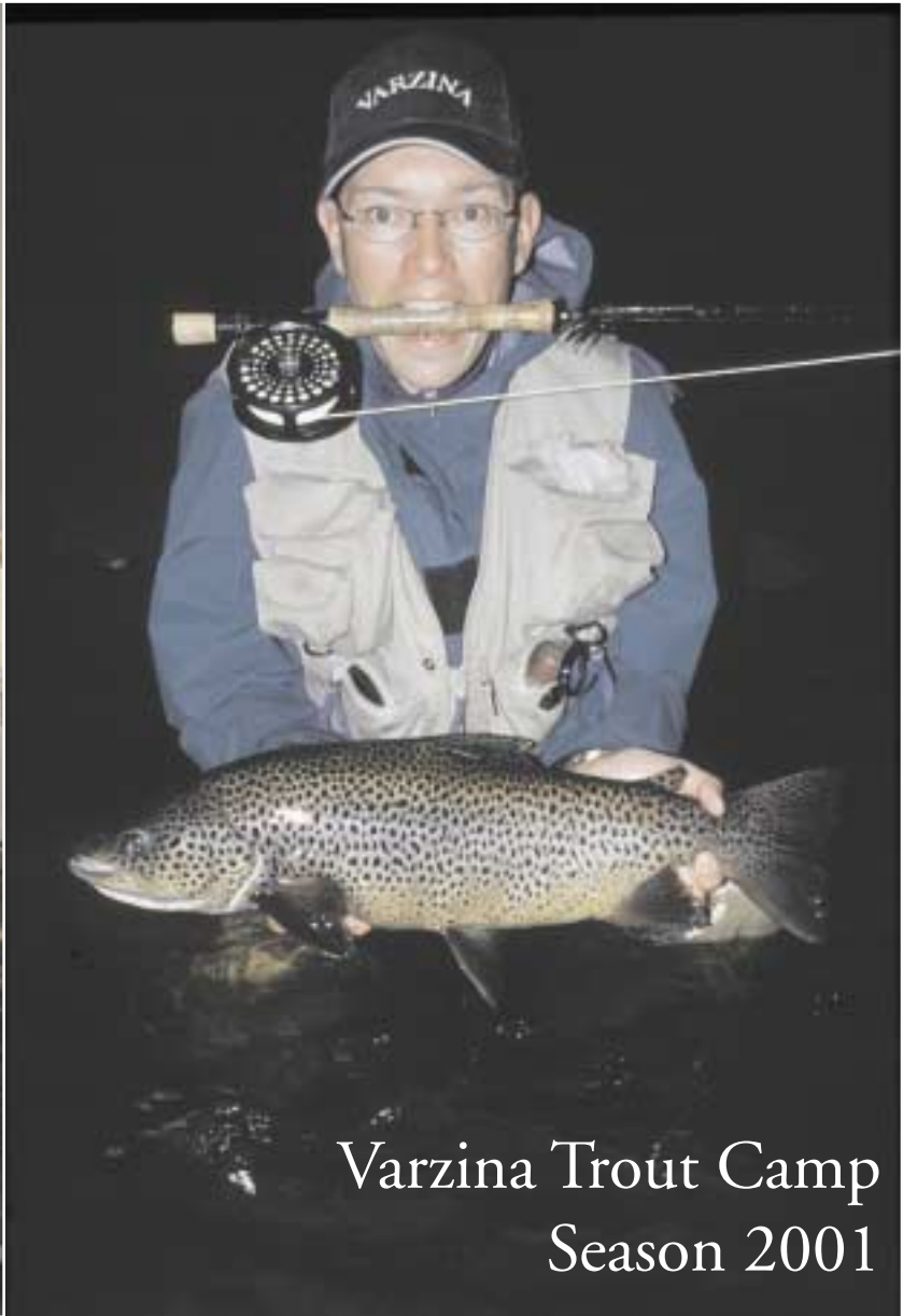
Varzina Trout Camp Season 2001