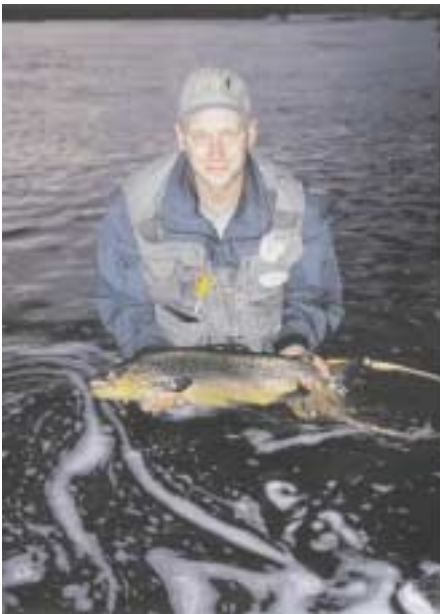
Above: The top-rod of the season with one of his trophies. In total he landed 49 trout over 50 cm (20 inches) and 23 salmon. His biggest salmon was a 125 cm monster weighing approx. 20 kg.

The best fisherman of the season landed no less than 49 trout over 50 cm. The same “top-gun” also landed during the same week 22 salmon including several over 20 pounds fish and one giant of 125 cm. Being in a good condition, that fish must have been somewhere around 45 lbs. What makes his achievements even more impressive is that most of his fish, including the monster, were caught on a new type of dry fly fished with a class 7 weight single hand rod. The same guy also landed several trout over 70 cm, the biggest being 72. Again, nearly all of them with a dry fly. In this case with a small caddis imitation. During his stay, he earned a nickname “The Machine” from his fellow anglers -very justifiable, I might add.